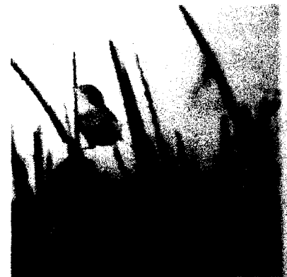
Sedge Wren, Crawford County, 23 June 1988.

fly to another area of this territory when flushed and would not leave the one-acre tract, although the field was 25 acres in size and contained the same plant composition throughout. I did not note any other wrens in the field.